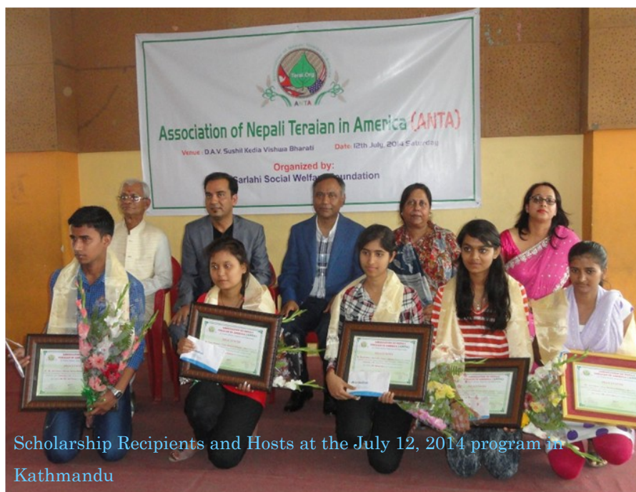
Scholarship Recipients and Hosts at the July 12, 2014 program in Kathmandu