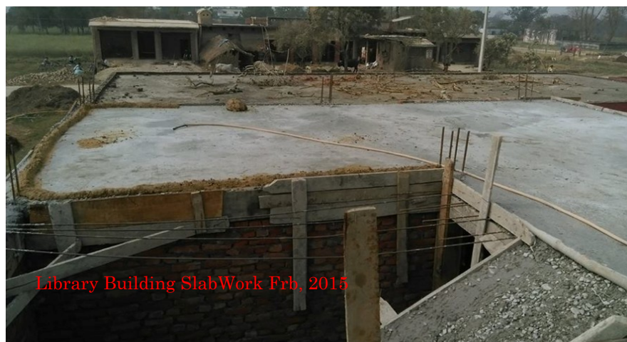
Library Building Slab Work Feb, 2015