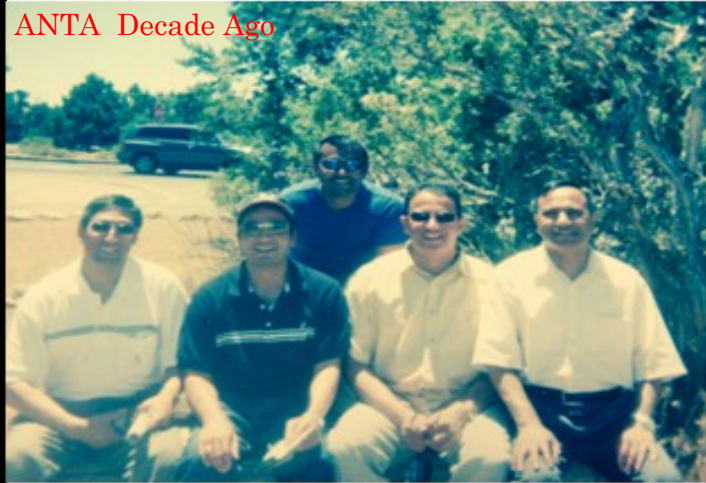
ANTA Decade Ago