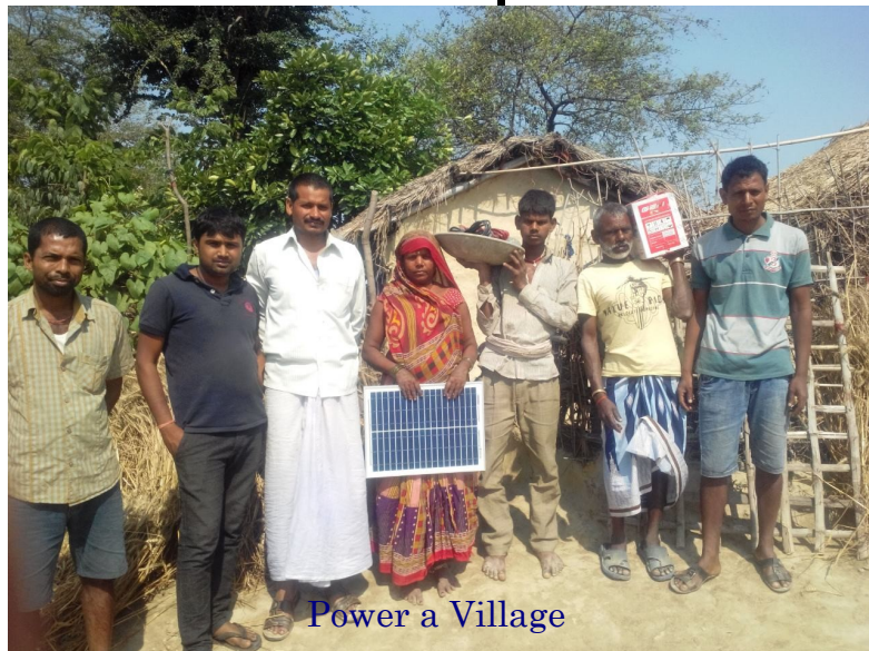
Power a Village

In the beginning of 2015, ANTA collaborated with stu-